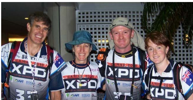
Team It's all good .

Note that the BK club is moving towards creating annual Adventure Sports Awards. (See p18).