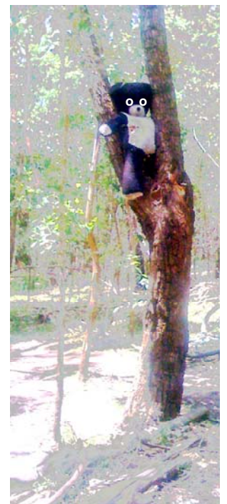
The Bear Control