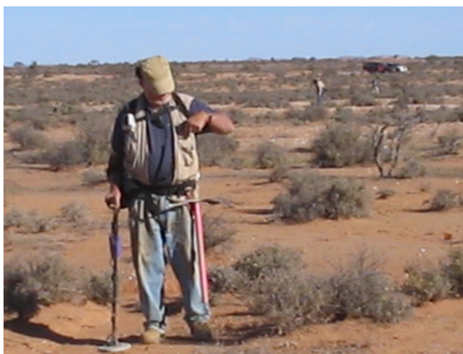
Prospecting and finding gold.

The verdict? Great scenery, but the cold nights.