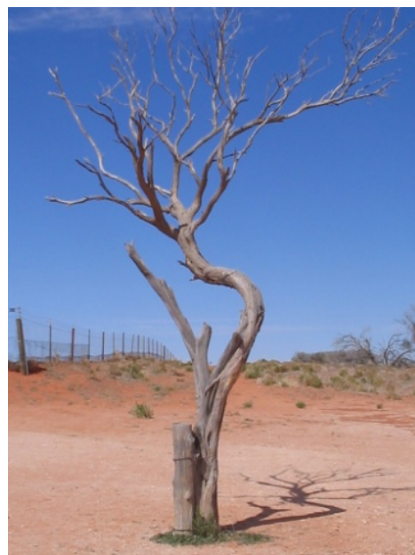
Tree at Cameron Corner with Dingo Fence behind